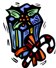
TABLE TOP GIFT EXCHANGE

Bring DOLLARS for meals. Receive a prize ticket for each DOLLAR you bring. Drawing for prizes will be held. The more you donate the more chances you have to win!