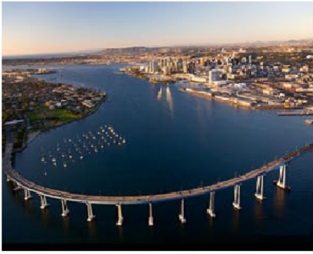
San Diego Coronado Bridge