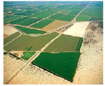
Imperial County Farm Land

Chapter 17 San Diego and Imperial Counties District G